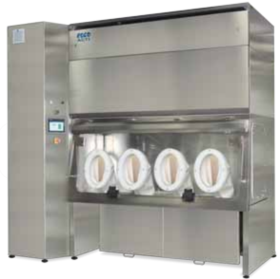
Aseptic Containment Isolator (ACTI)